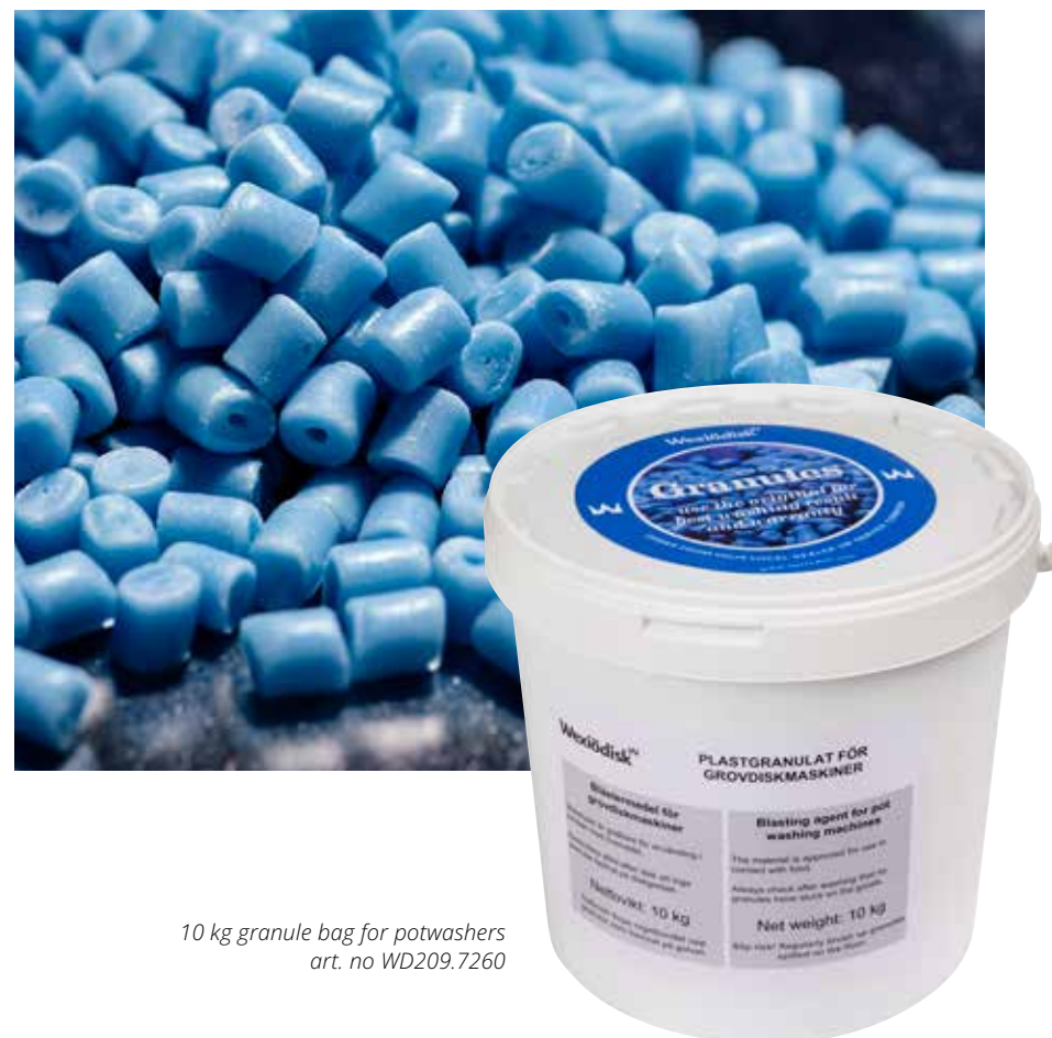
10 kg granule bag for potwashers art. no WD209.7260